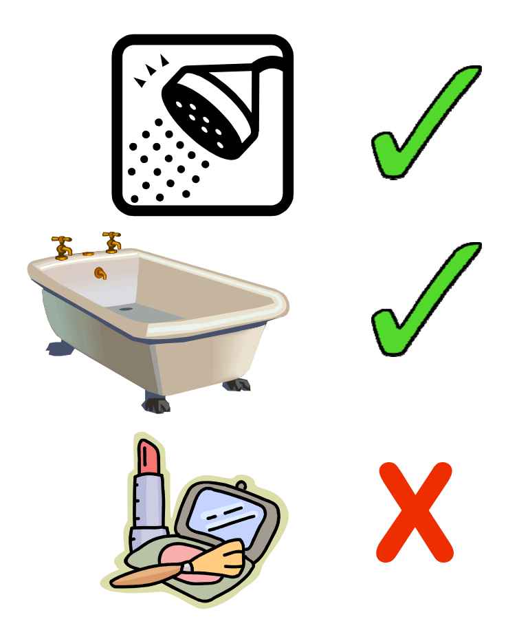
Please do not put any cream or make-up on once you have had your shower or bath

Please have a shower or bath before you come.