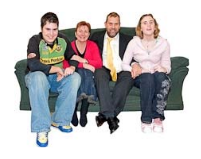
Family/carers can call Day Surgery Unit at any time