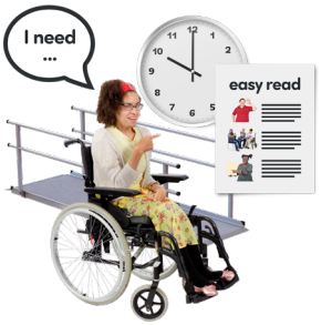
Talk about any reasonable adjustments

If you need someone to support you tell NHS staff