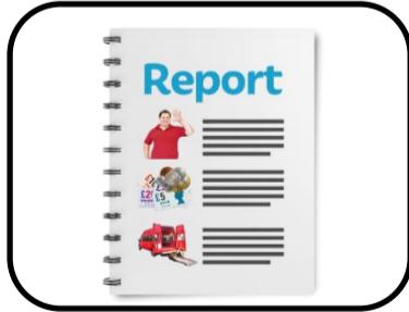
Feedback report for Commissioners