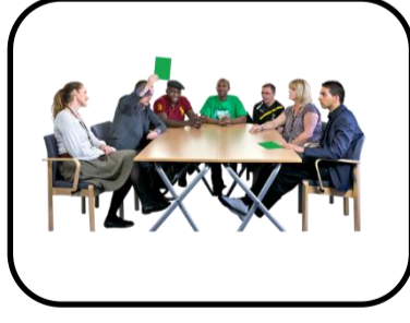
LD Partnership Board meeting