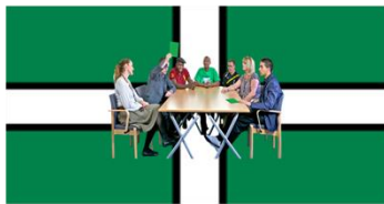
Devon Learning Disability Partnership Board

We asked the group what priority they would like to work on next